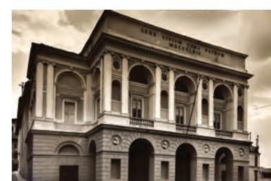
Postcards collected by Jerome Robbins during his visits to Spoleto, Italy.