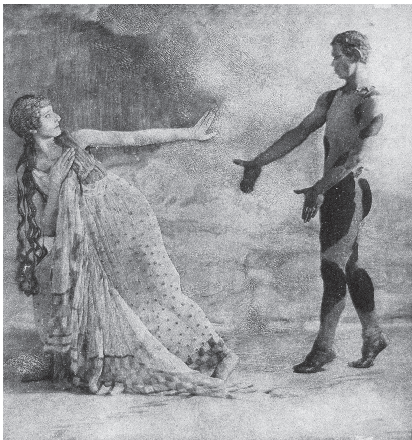
Lydia Nelidova and Vaslav Nijinsky in Nijinsky's L'Après-midi d'un faune, 1912.