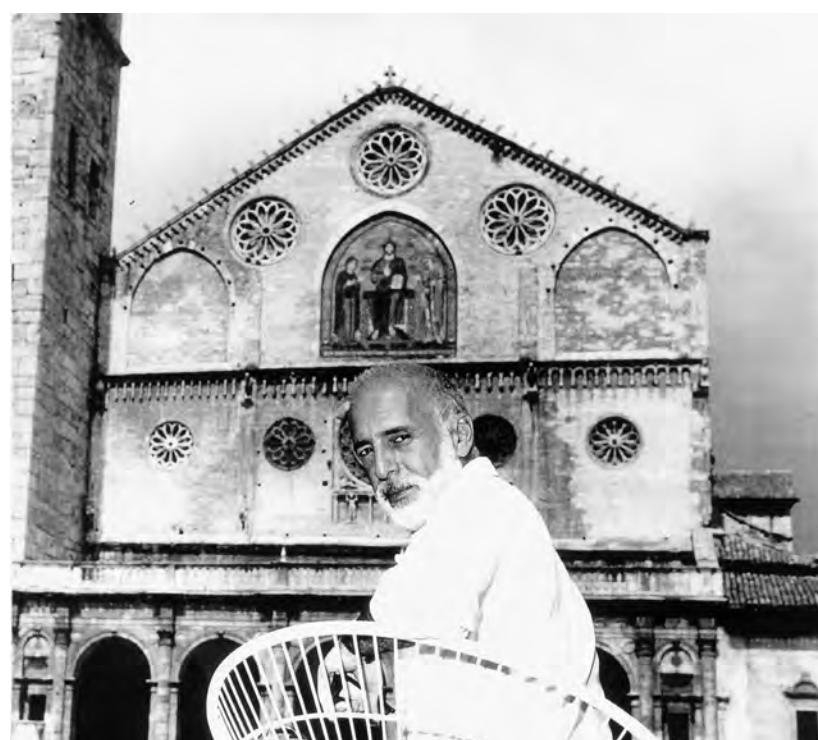
Jerome Robbins in Spoleto.

"When I went there in 1958, it was the first time that I felt my life and my work were in equal balance. Here in New York, it's the work. It's lopsided. There, I felt I could do my work during the day and go out for lunch, and I was in heaven. Then I could go back to work and then have the evening free. It felt very right to me that way. It still feels that way to me when I go there.